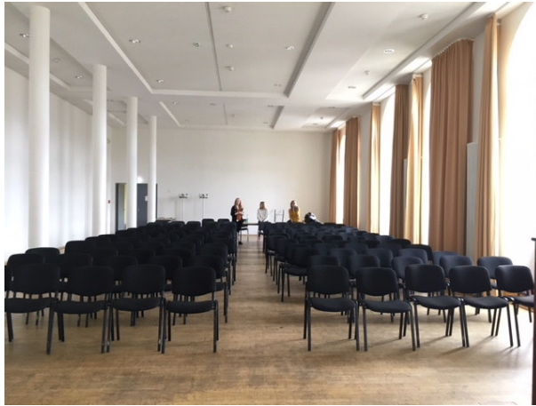
Balcony Hall on the upper floor