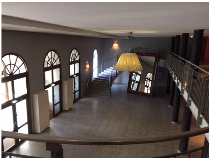
View of the foyer from the Mezzanine floor