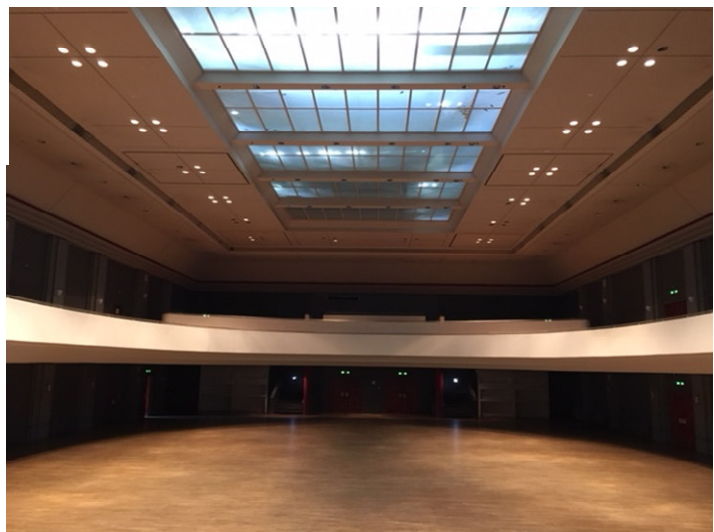
Hall incl. gallery